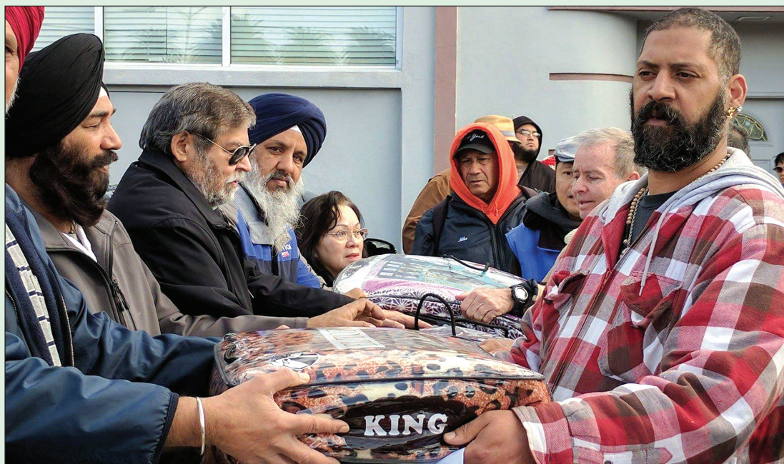
Point Church Christian parishioners and Gurdwara Sikh members work together to help the less fortunate.

SERVING EVERGREEN & SILVER CREEK VALLEY ■ EVERGREENTIMES.COM